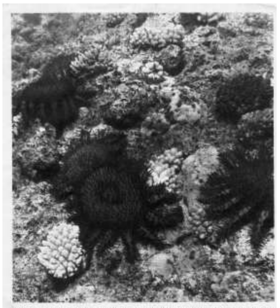
Fig. 3. A small portion of the advancing wave of A. ployed that has exten almost a coral along the northwestern sector of Guam. Densities as high as this extend alon a 2.5-km section of Guam's occal reefs.

Movement of populations is inferred from disappearance, by March 1969, of A. planci from Tumon and Piti bays where large numbers had previously been observed and by the appearance of large numbers of adults in previously uninfested areas. After eating most of the coral, the starfish spread north and south, killing the reef as they went. Observations of the advancing "front" showed that the population density was as high as one animal per square meter along a 2.5-km section of coastline (Fig. 3). Here the starfish were arranged in a relatively narrow, irregular band 5 to 20 m wide parallel to the coastline. Long bands sometimes broke up into groups that moved as amorphous herds of 20 to 200 individuals.