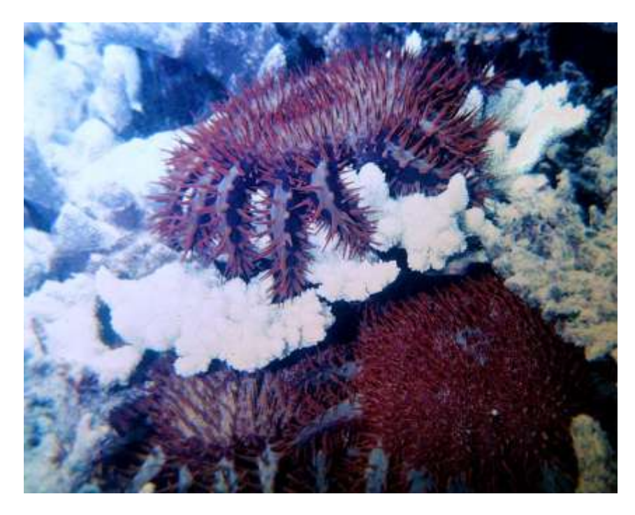
Figure 1. Acanthaster planci , normally a nocturnal coral predator often feeds during daylight in regions of high population densities.

Although A. planci , 60 cm in total diameter, were collected, those in the infested areas of Guam averaged 24.2 cm across the arms and 13.8 cm across the disk. The daily feeding rate was observed to be twice the area of the disk. Coral is therefore killed in areas of infestation at a mean rate of 378 cm2 per animal per day or about 1 m2 per month. In some localities, with population densities as high as one animal per square meter of reef, all living coral would be eaten in 1 month.